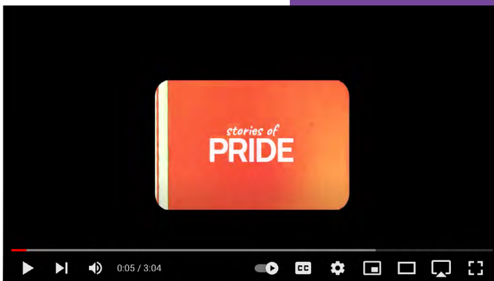
Screenshot from YouTube.

About DEI Insights | Thank you for taking the time to explore this issue of DEI Insights.